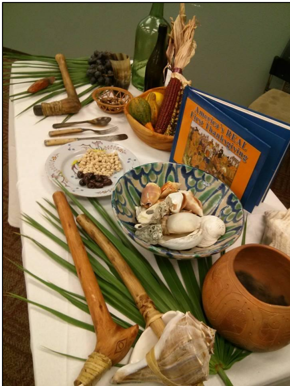
First Thanksgiving table display for the Viva Florida 500 program and presentation at Safety Harbor Public Library.