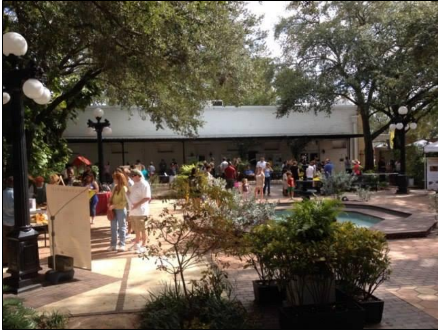
SEAC Public Day at the Ybor City Museum State Park.