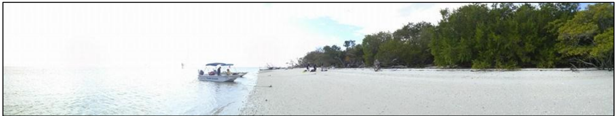
Cape Romano fieldwork site.