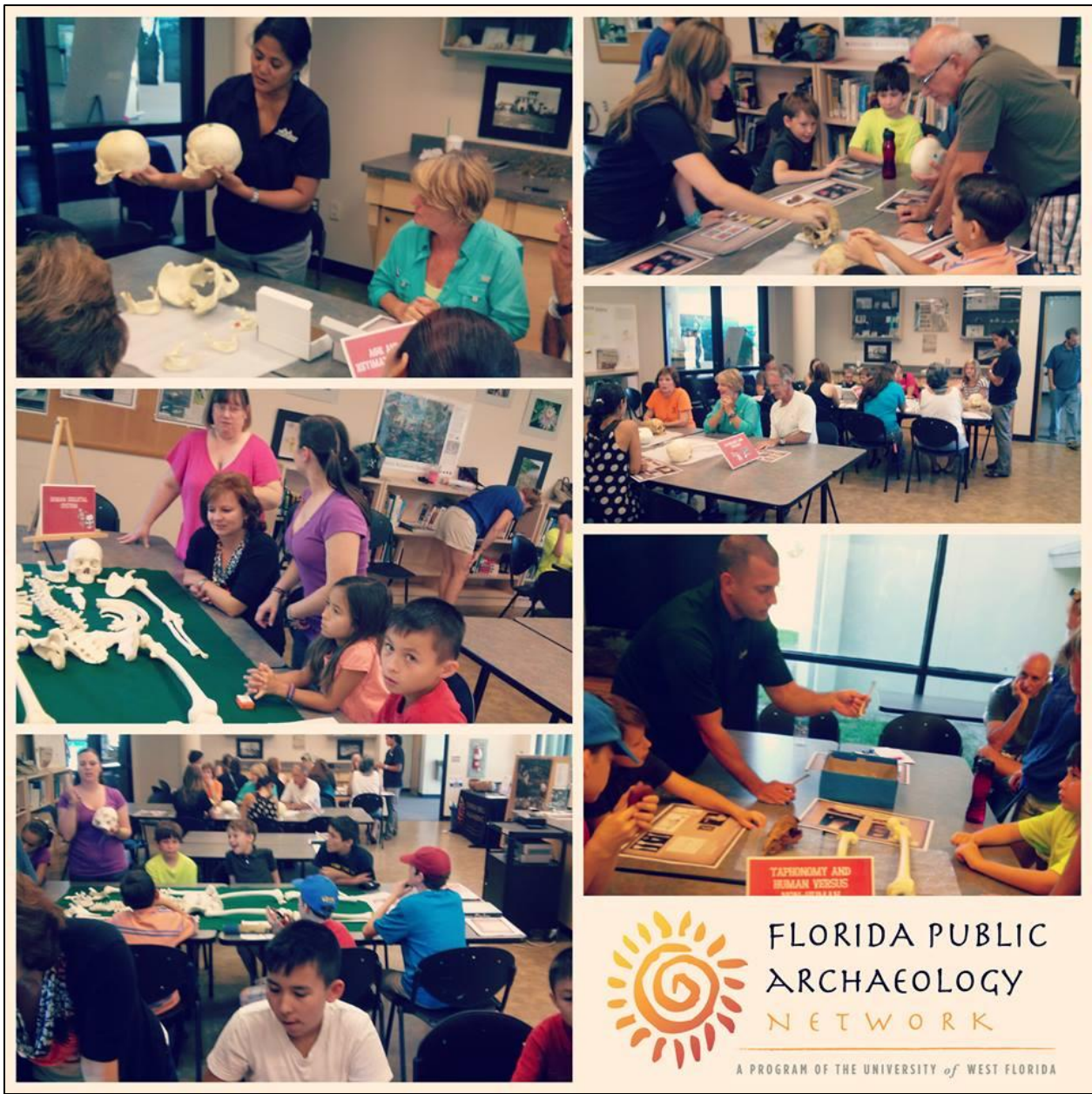
Archaeology Works: Bones