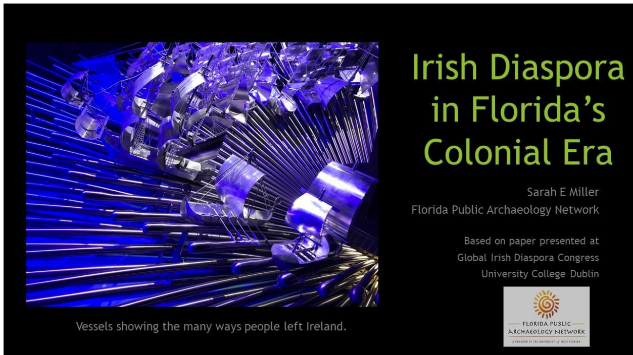
Image 1. Title slide for Irish Diaspora in Florida talk for IRSC to celebrate St. Patrick's Day.