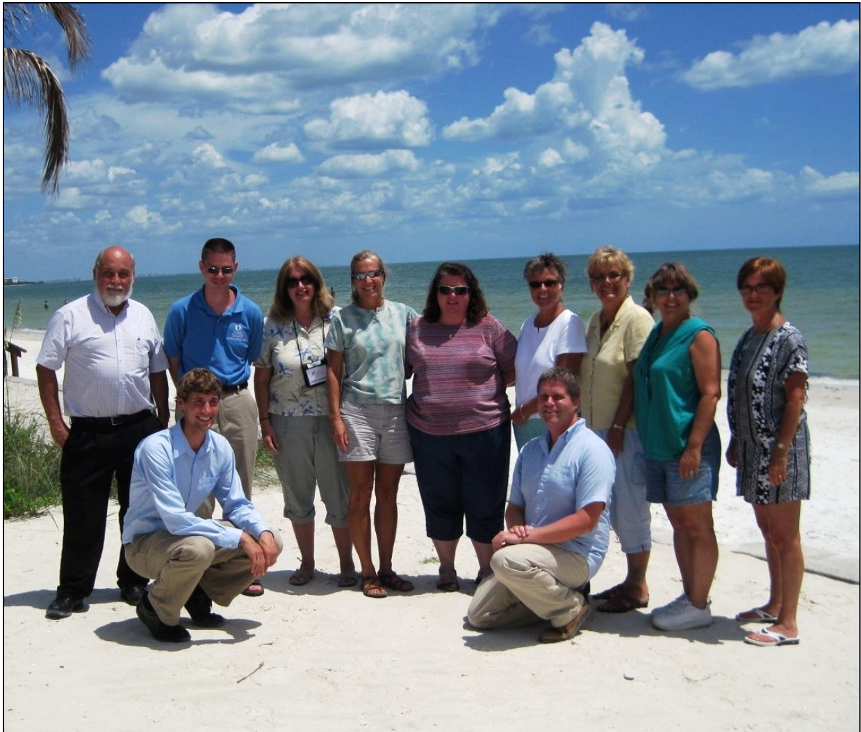
Southwest Region's first Project Archaeology: Investigating Shelter teacher training workshop.