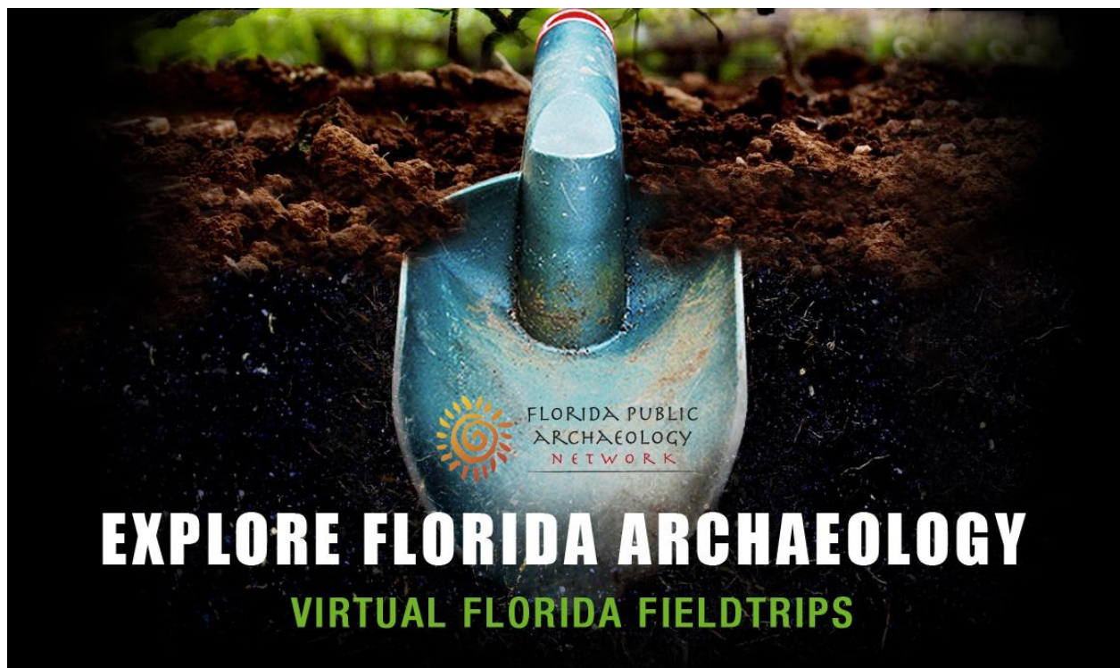
Magnet distributed for the first time at SHA's Public Day at Kingsley Plantation advertising virtual Florida fieldtrips.

We are very grateful for being included in the organizing committee for SHA, particularly for the opportunity to host the public day. The benefits of this event extended beyond the public and professionals who participated by improving overall communication and cooperation among heritage partners in northeast Florida. Using Public Day as a deadline, we turned an idea for making Virtual Florida Fieldtrips into a reality. The Center's media intern produced a series of videos featuring significant archaeological sites: Castillo de San Marcos, Sugar Mills, Ximenez-Fatio House, Kingsley Plantation, Nombre de Dios, and use of GPR in historic cemeteries. At the public day a bay of six computers with headphones were available to view the videos. Since January the videos have yielded over 7,000 views on Youtube and been integrated into Center activities, such as festival tables and teacher training workshops.