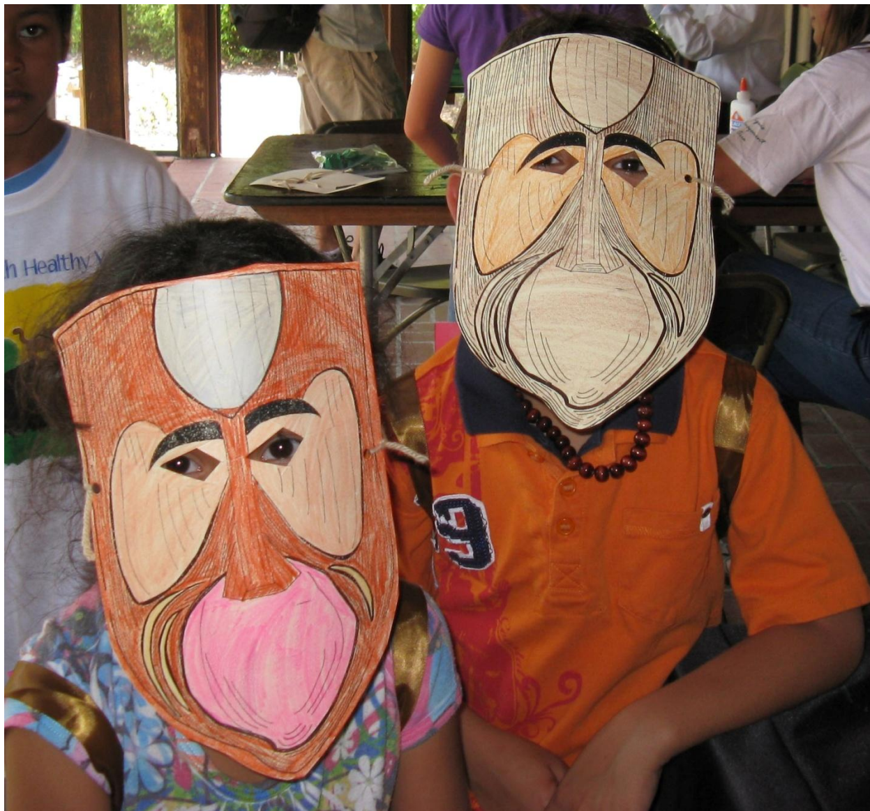
Mask Making at the Anne Kolb Nature Center archaeology day.