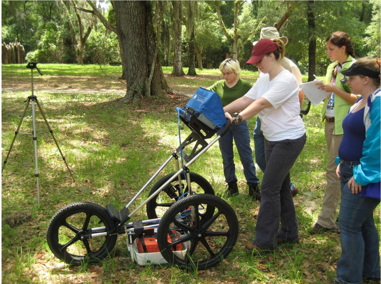
Ground Penetrating Radar being used at Fort Cooper State Park.