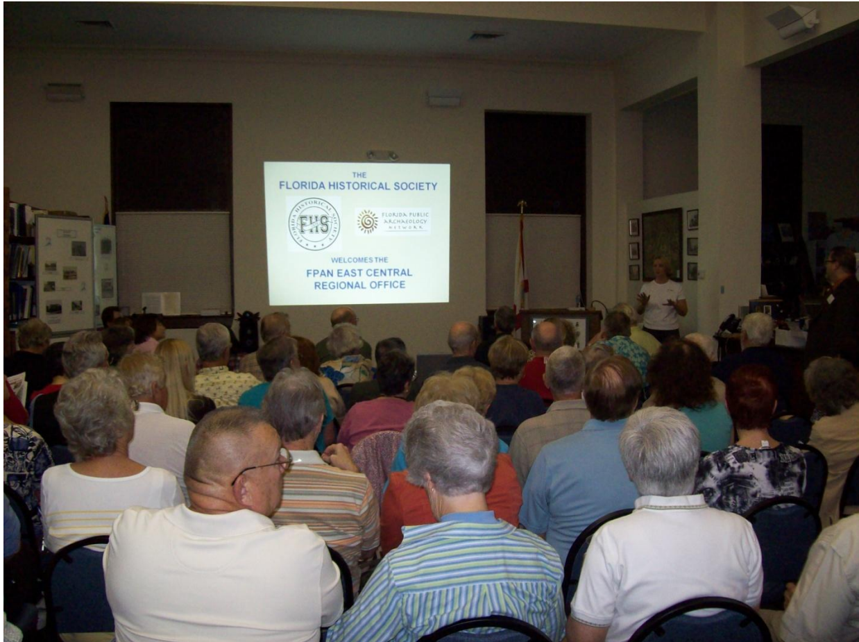
Open house introducing the Florida Historical Society as the new host of the East Central Regional Center of FPAN.

contacts in these counties, we will be providing summer camp activities, lectures series in public libraries, and guest lecture appearances for organizations throughout the East Central region.