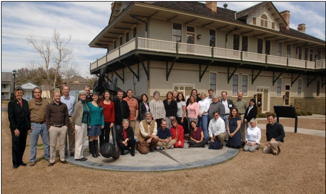
FPAN Board of Directors, Staff, Principal Investigators, and planners from Pandion Systems pose in front of the FPAN Coordinating Center during a break in the strategic planning retreat in March of 2010.

The University of West Florida retained Pandion Systems, Inc. of Gainesville to conduct strategic planning, and this work began in December of 2009. A variety of activities, including a two-day planning retreat, culminated in the creation of a robust plan for FPAN's next five years (2010-2015). This process resulted in creation of a vision statement, revision of our mission statement, and development of a strategic plan with 11 goals and a total of 32 objectives. In addition to the actual plan, this exercise was extremely useful in bringing the Board and staff together to grapple with developing a common vision for the future of this program; this in itself was probably as important as the development of the goals and objectives.