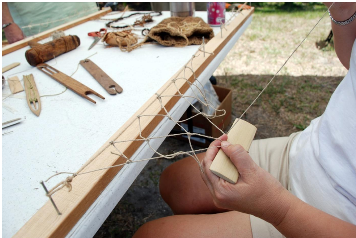
Rancho Regattas 2010 participant try their hands at a traditional netmaking activity.

Rancho Regattas 2010 , an outreach program developed by staff, highlighted the Gulf Coast's maritime heritage through Cuban Fishing Ranchos, culminated in three separate events throughout April, May, and June. Each event consisted of public presentations and related educational activities focused on traditional boating and fishing. A travelling museum exhibit also accompanied each event.