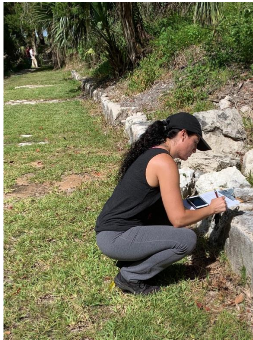
Scouts practice monitoring at HMS Florida training in the North Central region.