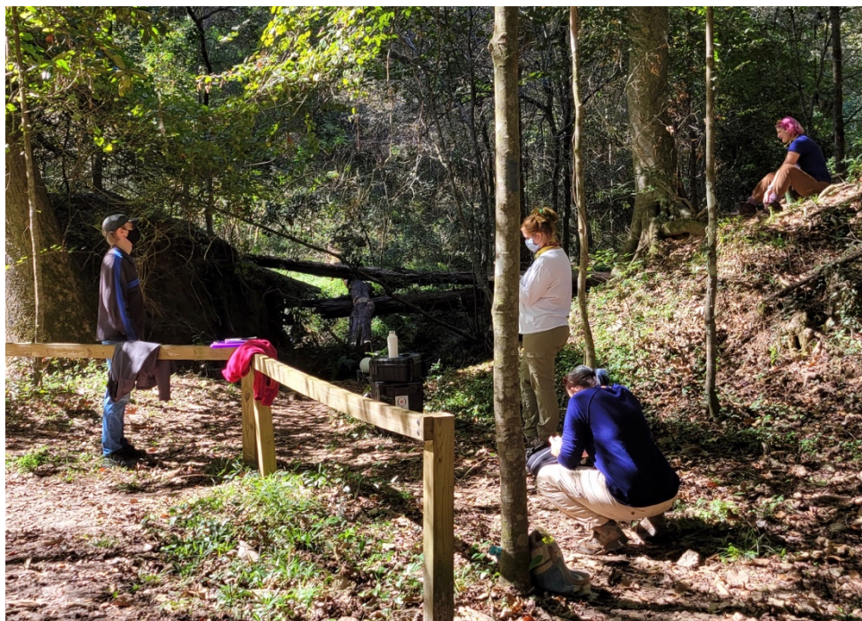
Socially distant 3D Scanning of Butler’s Mill (LE05997) at the Lake Jackson Archaeological Site, Tallahassee, FL