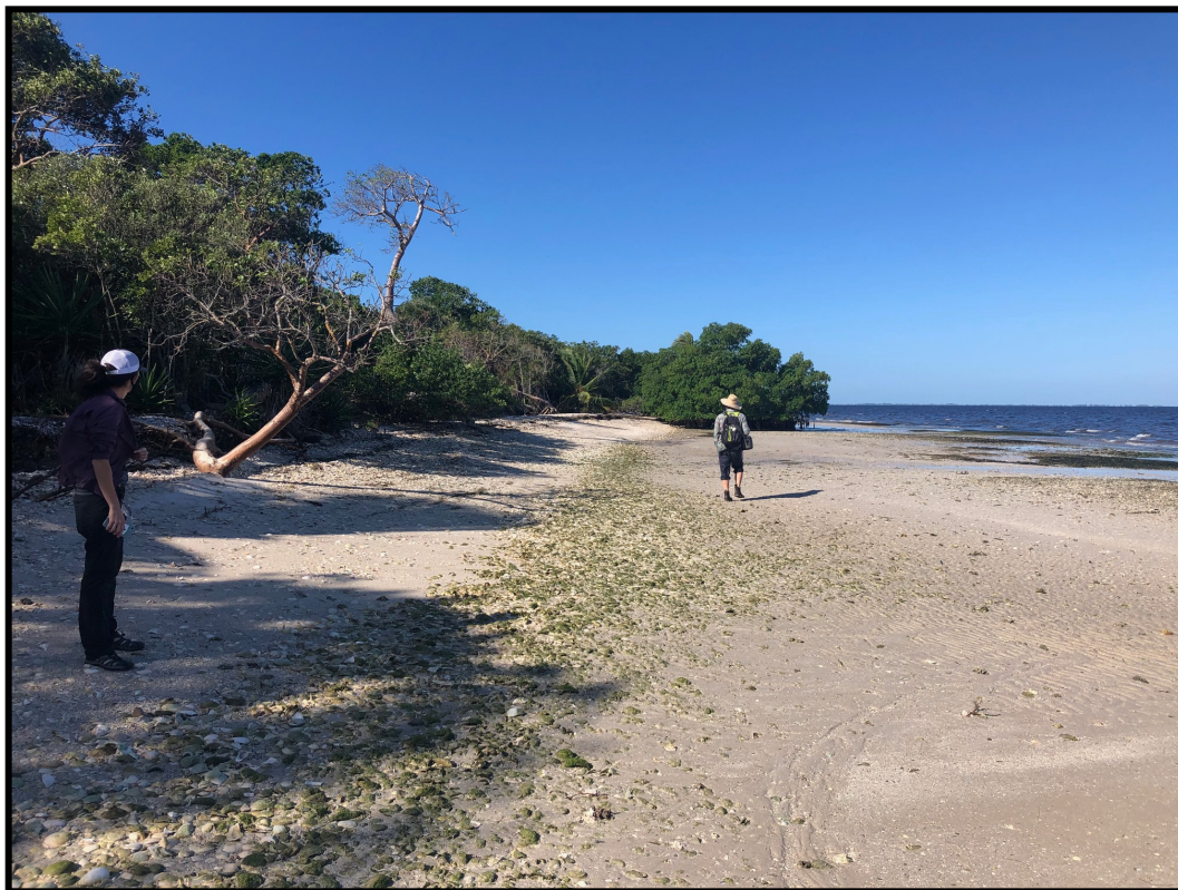
Rachael Kangas and Jeff Moates survey the eroding shoreline at Calusa Island

FPAN staff visited and scanned the site to document the current extent of the deteriorating conditions of the site. These scans will produce a critical snapshot of the deterioration of the site.